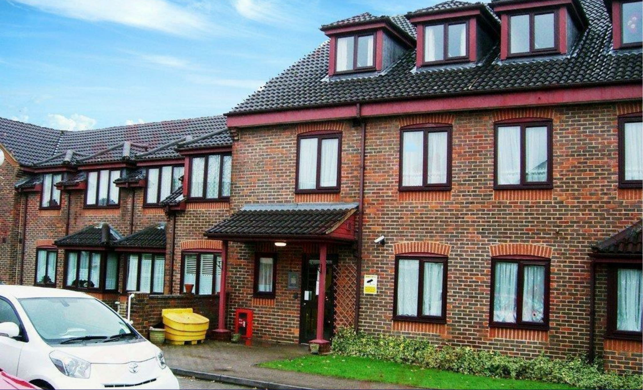
Barnetts Court, Corbins Lane, South Harrow, HA2 8EU Asking Price £72,500